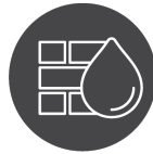
Damp Proof Membrane