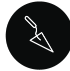
Damp Proof Course